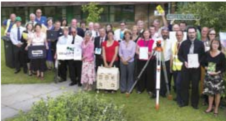
National accreditation for customer service excellence in the public sector.