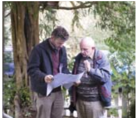
Planning and building control