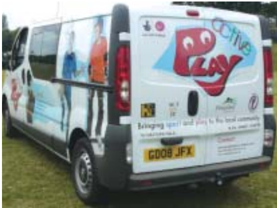
Mobile play facilities